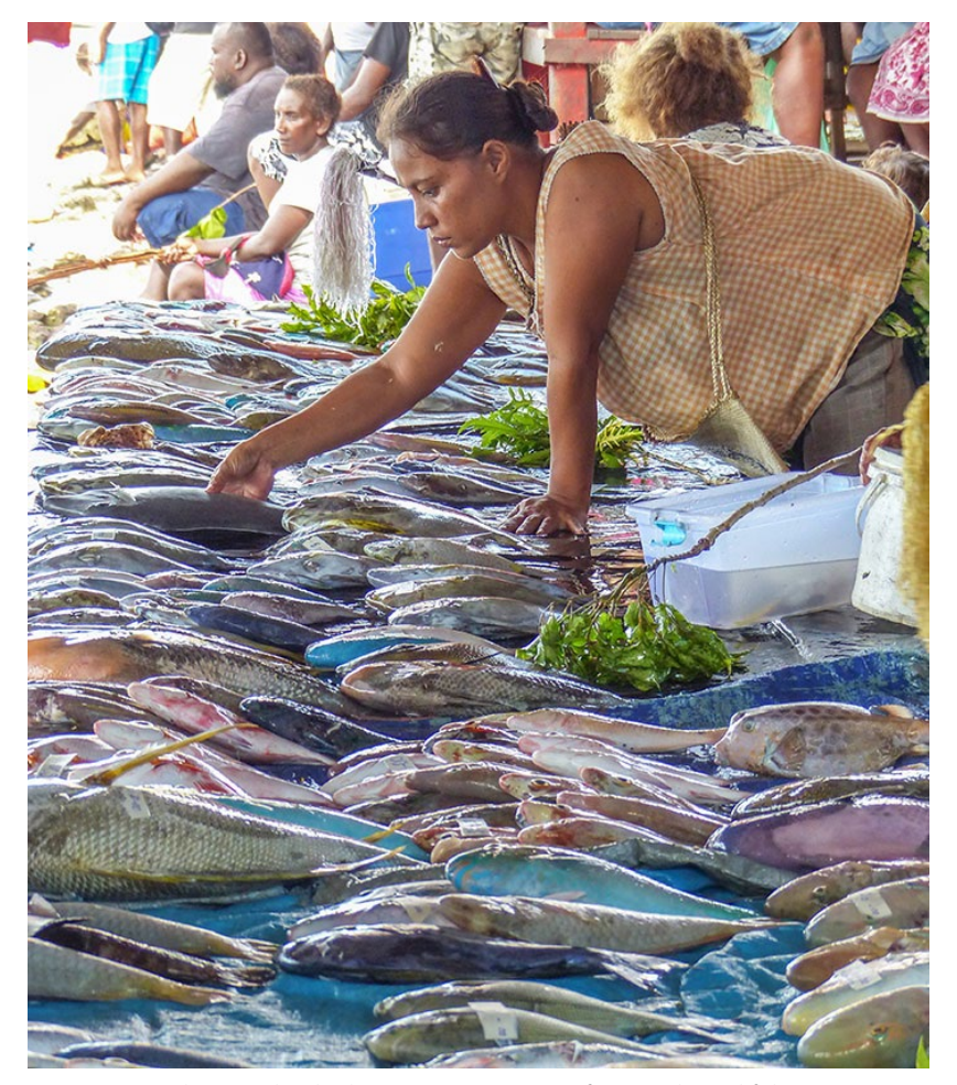
Figure 8. In Solomon Islands, the WWF project team first conducted fish measuring around fish markets.

Beginning in 2017, WWF began working with communities around Nusatuva, on the south coast of neighbouring Kolombangara Island, measuring about 1,000 fish during the course of the year. While only a couple of hours by outboard-powered boat from Ghizo Island, it is beyond