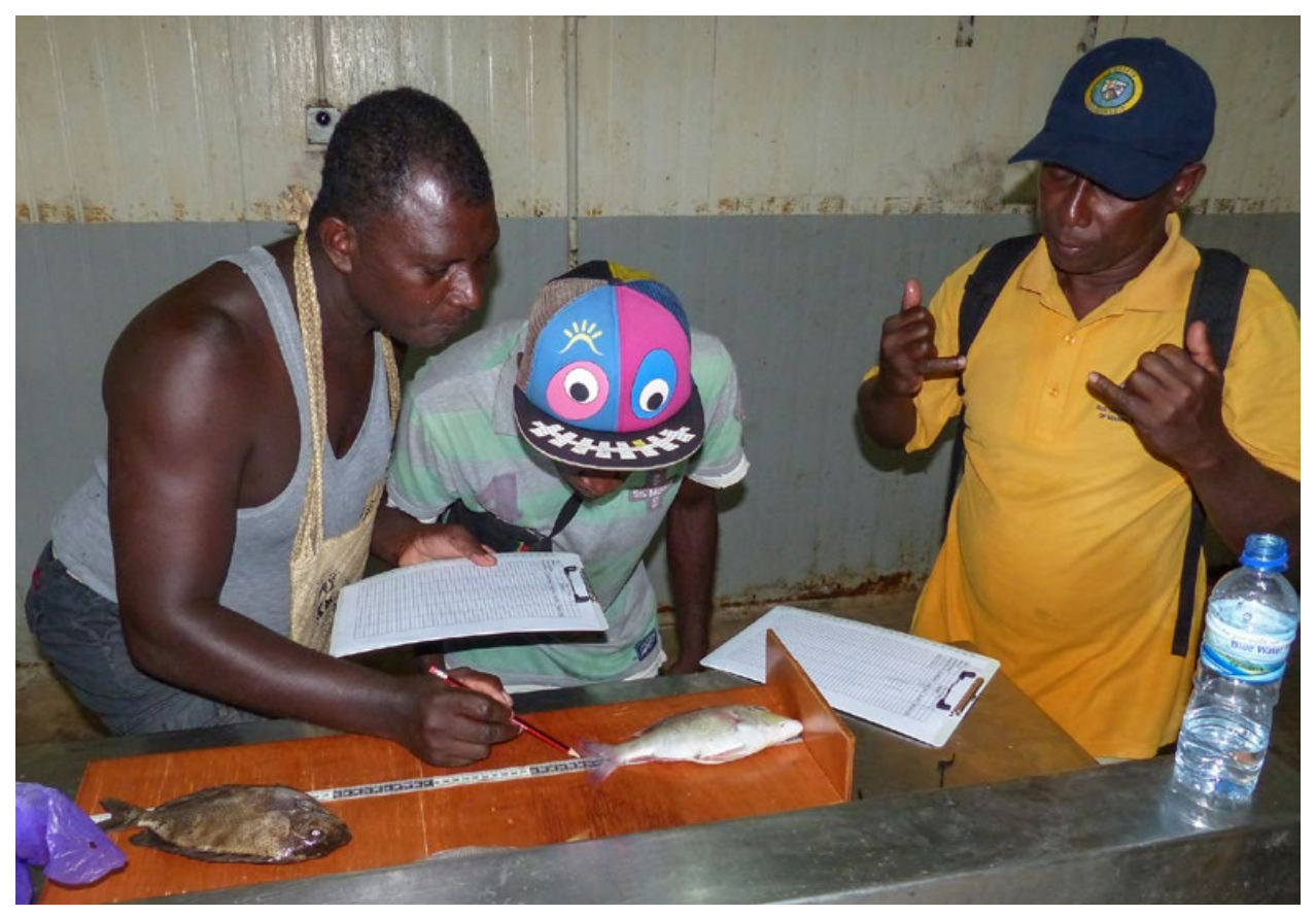
Figure 2. Learning to measure fish in Solomon Islands.

to measure the length of fish (Fig. 2) and macroscopically inspect them to determine whether they are immature or mature (Fig. 3). In many communities, we first engage workshop participants in constructing fish measuring boards out of plywood and old measuring tapes previously used for laying out coral reef transects, so that they can begin collecting SPS data (Fig. 4). Again, within the context of adult education methodologies, and regardless of the value of the data community members may collect, these hands-on activities usefully consolidate the concepts being taught, and enable community members to validate the information for themselves. We invariably find that community members are extremely interested in acquiring these skills, particularly the ability to examine gonadal status and determine whether fish are mature or immature. To our surprise, only a very few of the most expert artisanal fishers have prior knowledge about this. For most of our workshop participants, this is entirely new, informational and transformational for their understanding of local overfishing.