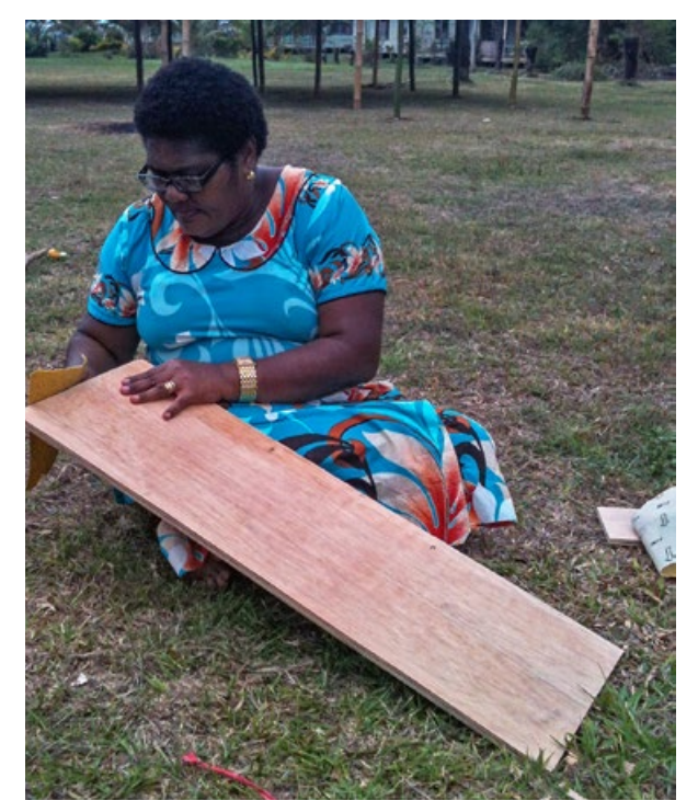
Figure 4. Making a fish measuring board in Fiji.

status of the fish he was observing in their catches. Similarly, in the Western Province of Solomon Islands where, with WWF, we have been measuring the fish catches brought in by surrounding communities, the communal examination of fish has engendered great discussions between the nighttime spearfishers, who catch predominantly immature fish, and the hook-and-line fishers who catch a much higher proportion of mature fish.