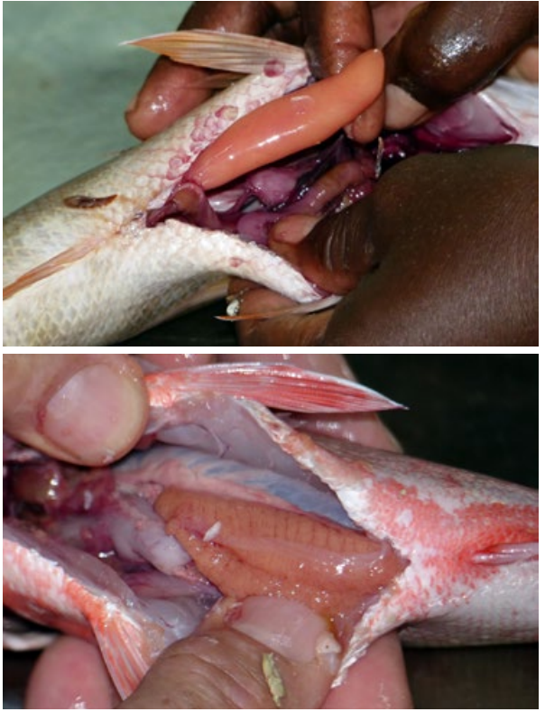
Figure 3. Learning to evaluate female gonad maturation stages is part of the training. Top: developing, bottom: ripening.

To illustrate the great interest that community members have in these matters, a Fijian WWF staff member working on a different project told us he had visited a remote island in Macuata Province some months after we had trained community fish measurers in a central location, and observed that every evening when the men gathered to drink kava, their main topic of discussion concerned how the observer gauged the maturity of fish, and the gonadal