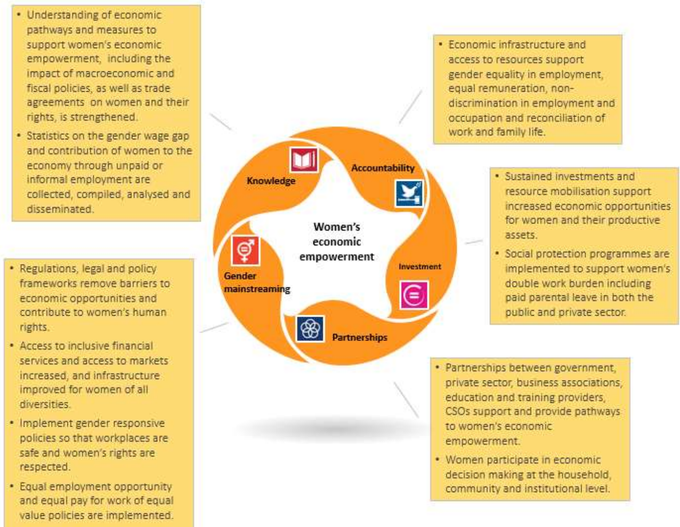
Figure 6. Summary of crosscutting strategies to achieve the PPA outcome – Women’s economic empowerment

Accountability: 1) Strengthen economic structures and access to resources to build gender equality in employment, equal remuneration for women and men, non-discrimination in employment and occupation type, and better reconciliation of work and family life.