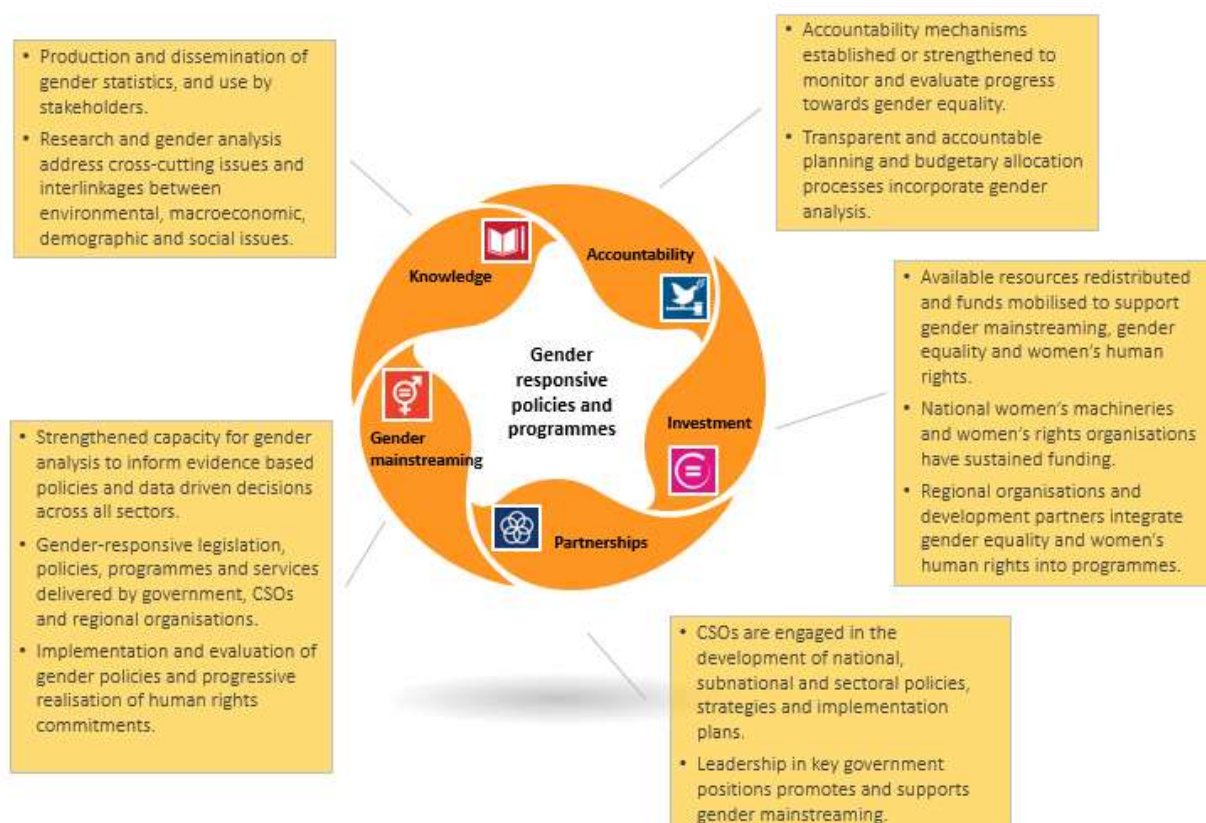
Figure 4. Summary of crosscutting strategies to achieve the PPA outcome – Gender responsive policies and programmes

The PPA also focuses on transforming harmful social norms and exclusionary practices.