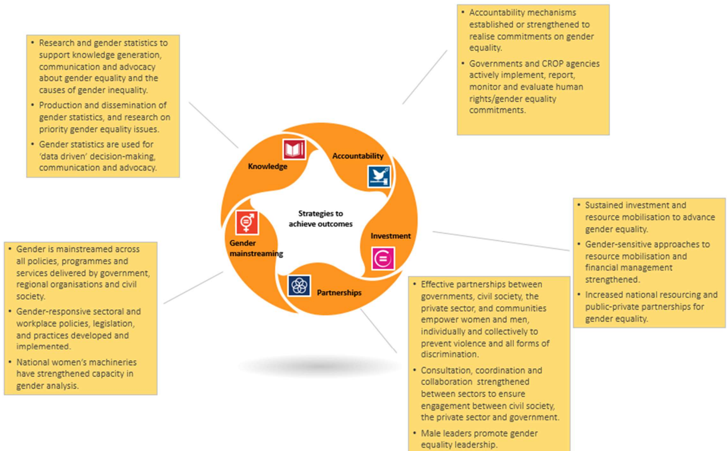
Figure 2. Summary of crosscutting strategies for achieving PPA outcomes