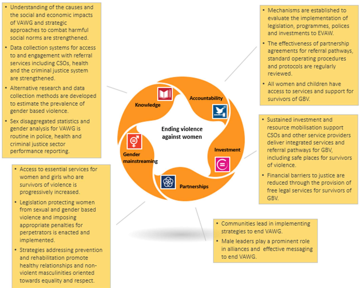
Figure 7. Summary of crosscutting strategies to achieve the PPA outcome – Ending violence against women

In the PPA, there is additional emphasis on addressing social norms and dynamics that perpetuate violence against women and girls.