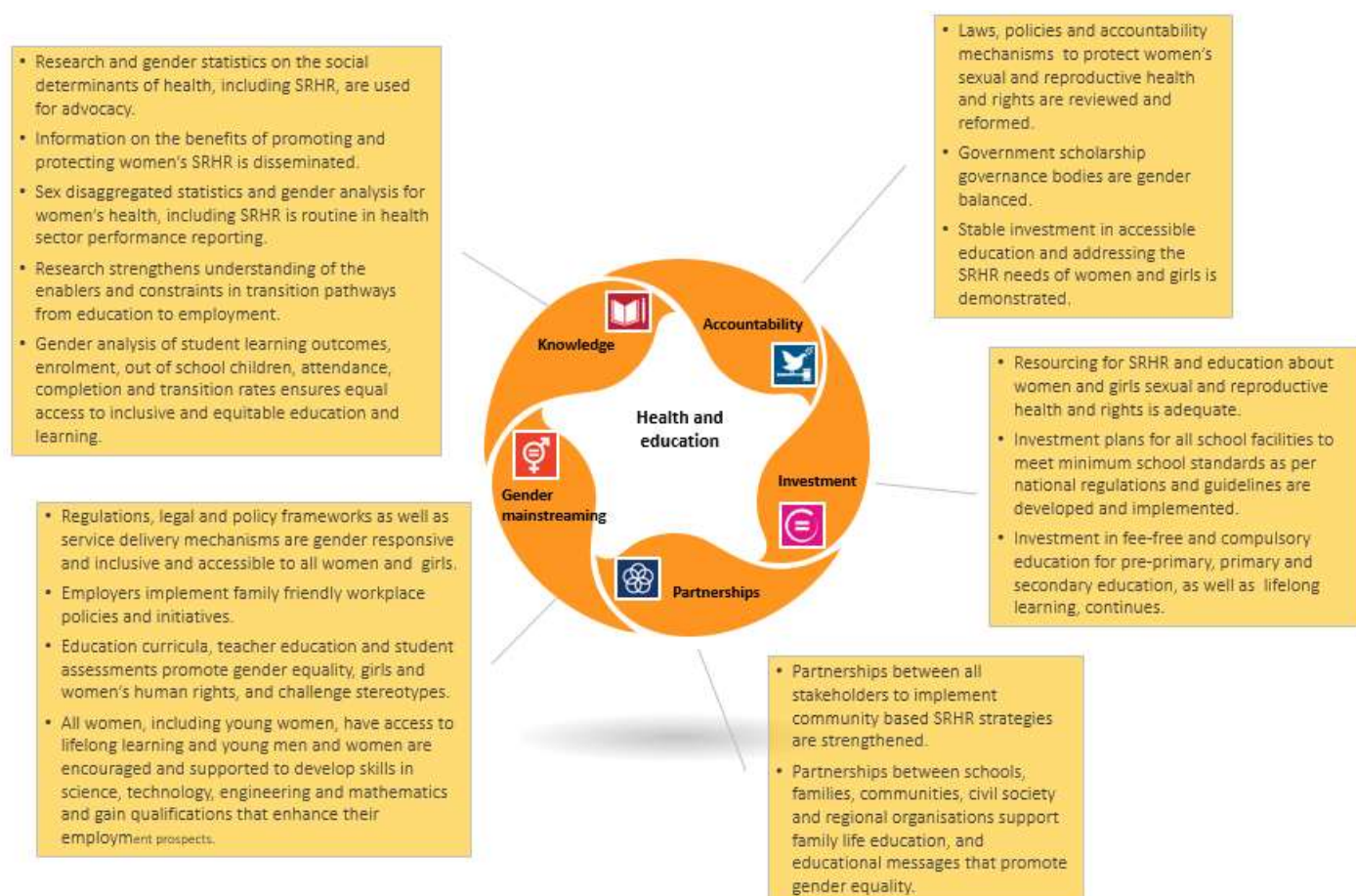
Figure 8. Summary of crosscutting strategies to achieve the PPA outcome – Health and education

Accountability: 1) Review and reform government laws, policies and accountability mechanisms to protect women's SRHR. 2) Ensure gender equality in governance bodies responsible for selecting government scholarship recipients. 3) Demonstrate stable investment in accessible education and addressing the SRHR needs of women and girls.