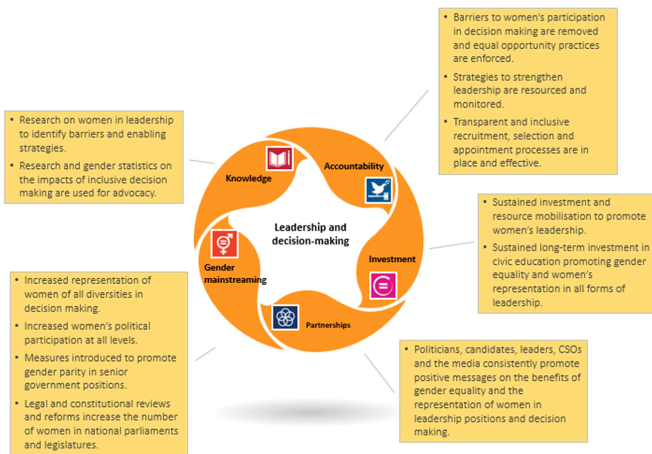
Figure 5. Summary of crosscutting strategies to achieve the PPA outcome – Leadership and decision-making

Accountability: 1) Demonstrate the removal of barriers to women's participation in decision-making and enforce equal opportunity practices. 2) Resource and monitor strategies to strengthen leadership. 3) Ensure transparency and inclusiveness in recruitment, selection and appointment processes.