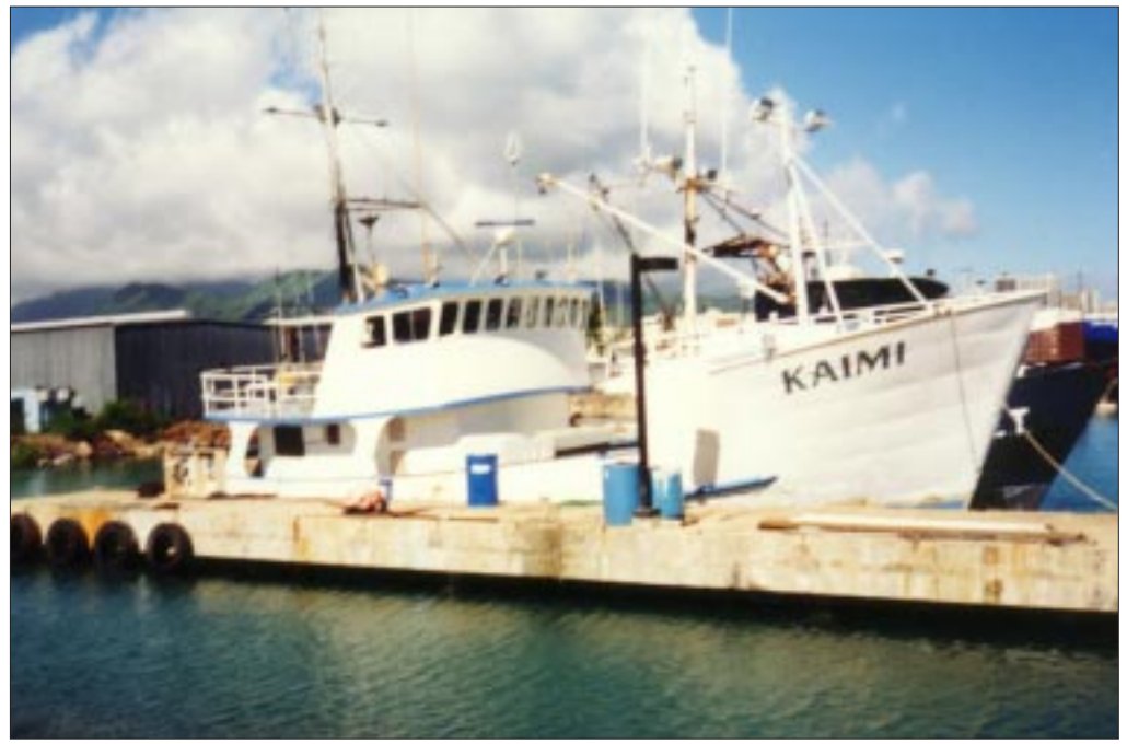
The F/V Kaimi is one of the longliners operating from Hawaii

However, longline vessels continued to interact with other marine turtles (Loggerheads,