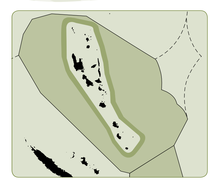
Figure 2. A portion of Vanuatu's EEZ, and the 12- and 24-mile zones.