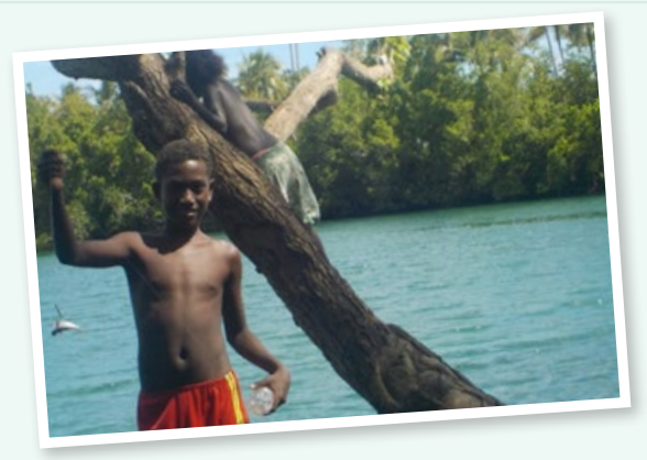
The picture shows a tree and branch, we use to fish. It is located in a bay and children fish here. This shows a fishing activity. It shows the place where children fish and it is close to the shore. The fishing activities are usually using line and hook and both adults and children take part in this fishing activity. Male participant, 2019

The two photos under this theme show that the main benefits that participants saw coming from fishing activities were income for individuals, households and the community. The first picture shows fish being sold by an old man to support his family. The second picture shows dollars earned by a young man and his family to survive. The other two