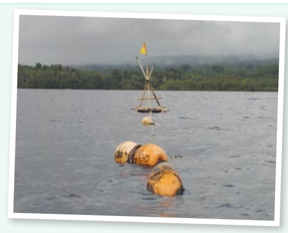
A rafter is shown in the picture because that is where we fish and sell our food. It is special because WorldFish made it for us. Fishers use different fishing methods to catch different fish there. The rafter has been built so we can go and fish there. In this way we look after our reefs. I want to tell other people to do the same and help others. I just want to say that we must do these things (rafters) to help our reefs. In this way, we won't destroy our reefs. We do this to help our community and our children for our future. Male participant, 2019

There were some challenges with using this method. On its own, photovoice can be limited in the way it answers research questions. This method would work better if it was used to triangulate other research on gender, community-based resource management or fisheries. This method can be costly, and participants may need more time for taking pictures; therefore, proper planning is needed. On the other hand, photovoice is a very easy method that can be used to help voice people's opinions to others. Images are powerful and