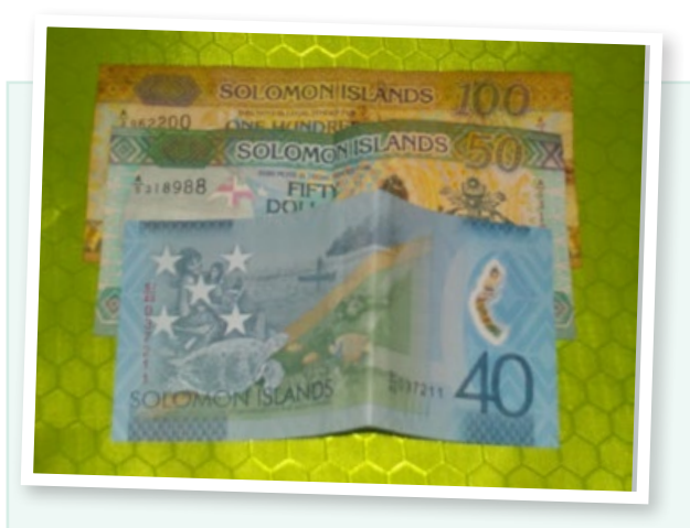
In the picture is money. There is a 100 dollar bill and 50 dollar bill. I took this picture because this is a benefit from fishing. We sell fish, we earn money to survive. We help our family and an individual. A man can benefit from fisheries. This is a clear benefit from fishing. It benefits the family very much. Male participant, 2019

The two photos show the most common fishing activity in Santupaele as described by the respondents. This is fishing by hook and line. The fishing activities are located close to the shore, which shows that accessibility and location is important for fishing in Santupaele. This type of fishing activity requires less gear and is less expensive. Other respondents highlighted other fishing activities such as fishing at the FADs and spearing fish. Participants also highlighted the importance of having a marine managed area as a part of their fishing activity.