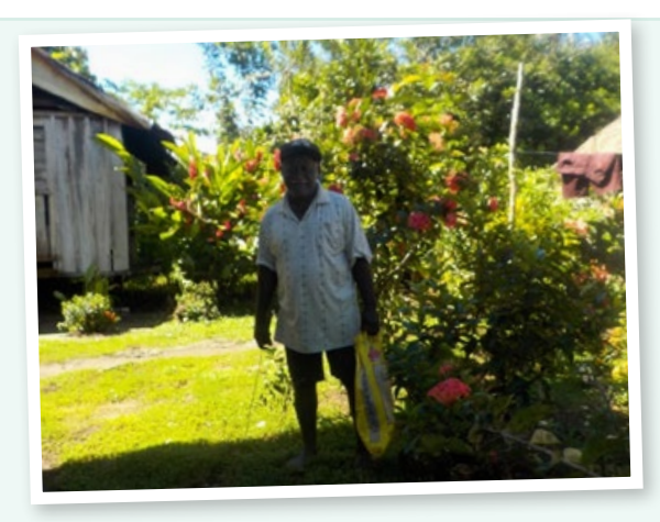
This is an old man. He is my father. He is an elder in the community. He is very active in the community in any community work that we have. He usually blow the horn to call the community to do work. My thoughts on this is that he is an old man now and should be resting but out of every elder in the community, he is the first man to do work. He talks about work but he also works. He does that for our school, church and even at the home. He is a best contribute to work in Santupaele and we can see the outcome of that contribution in our community. Female participant, 2019

How do women and men engage in decisions regarding fisheries?