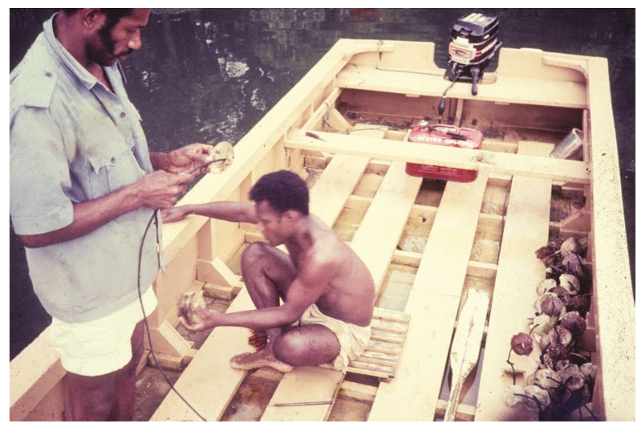
Preparing wild oyster spat collectors, Fiji, May1971.

Also in 1974, the first main project implemented by SPC for coastal fisheries development, the 'Outer Reef Artisanal Fisheries Project (ORAFP)' commenced. The project had