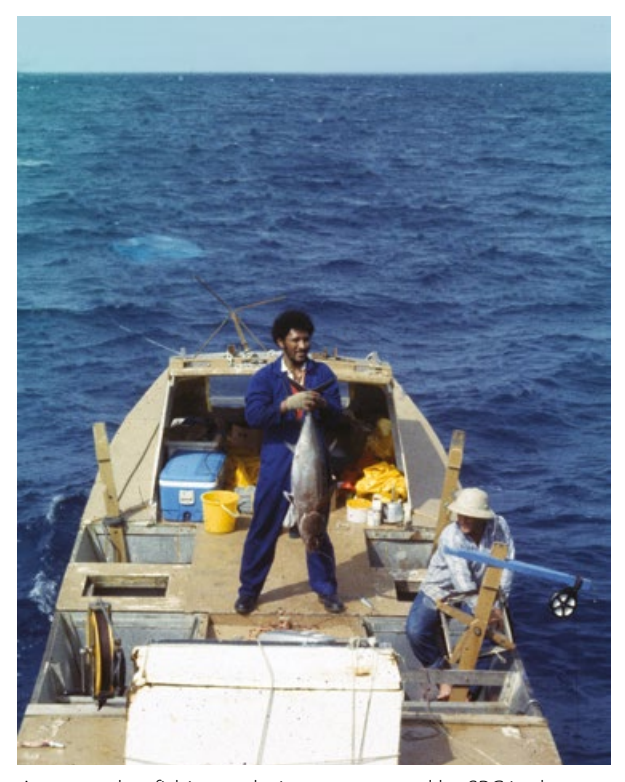
Among other fishing techniques promoted by SPC in the 1980s, the use of the palu-ahi and vertical longlines around FADs allowed to access the bigger deep-swimming tuna. Note the sea anchor used to fish while slowly drifting, facing wind and swell. Fiji, 1984.

Fisheries departments in Pacific Island countries and territories (PICTs) continued to expand in the 1980s, as new graduates from USP with the desired skills became available for employment. The focus was still on fisheries development, and many countries continued their boat building programmes as well as training programmes to support new fishers with the equipment and skills to earn a living from fishing. Some countries like Fiji and Western Samoa had extension services that would assist fishers in the field with their fishing operations. Government operated ice plants