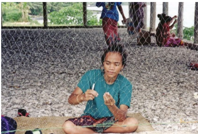
Conducting scientific assessments to get a better understanding of reef species stock status (Aitutaki, Cook Islands, 1995;) and organising training workshops for fisherwomen (Futuna, Wallis and Futuna, 1997;) were some of the activities run by SPC's Costal Fisheries Programme in the 1990s.

and the coordination of a post-harvest fisheries study tour in the Pacific Latin American countries of Mexico, Ecuador, Peru and Chile. In late 1991, a Woman's Fisheries Programme commenced within the FHPP, to develop, coordinate and enhance post-harvest activities for women throughout the Pacific. The first activity was a workshop on fish processing and marketing held in Kavieng, PNG in 1992.