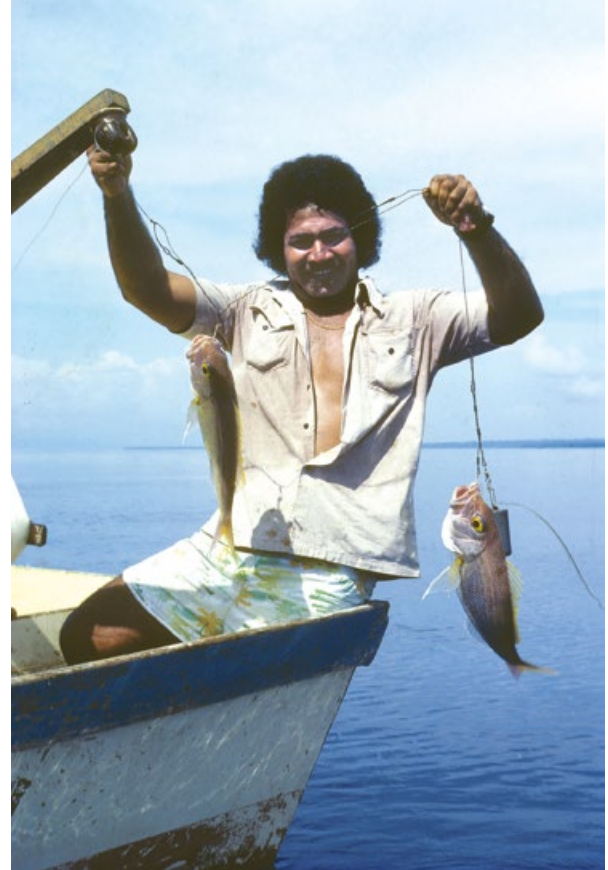
Successful use of the 'Western Samoa handreel', Santo, Vanuatu, 1982.

if possible. Atoll locations or steep reef slopes, with little area in the 100–400 metre depth range, had lower catch rates in general than locations with a more-gentle gradient, which increased the 'fishing area'. From 1980 to 1984 the project undertook 19 assignments in 14 countries and territories.