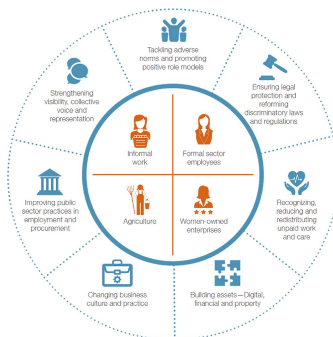
Figure 1. Seven primary drivers of women's economic empowerment