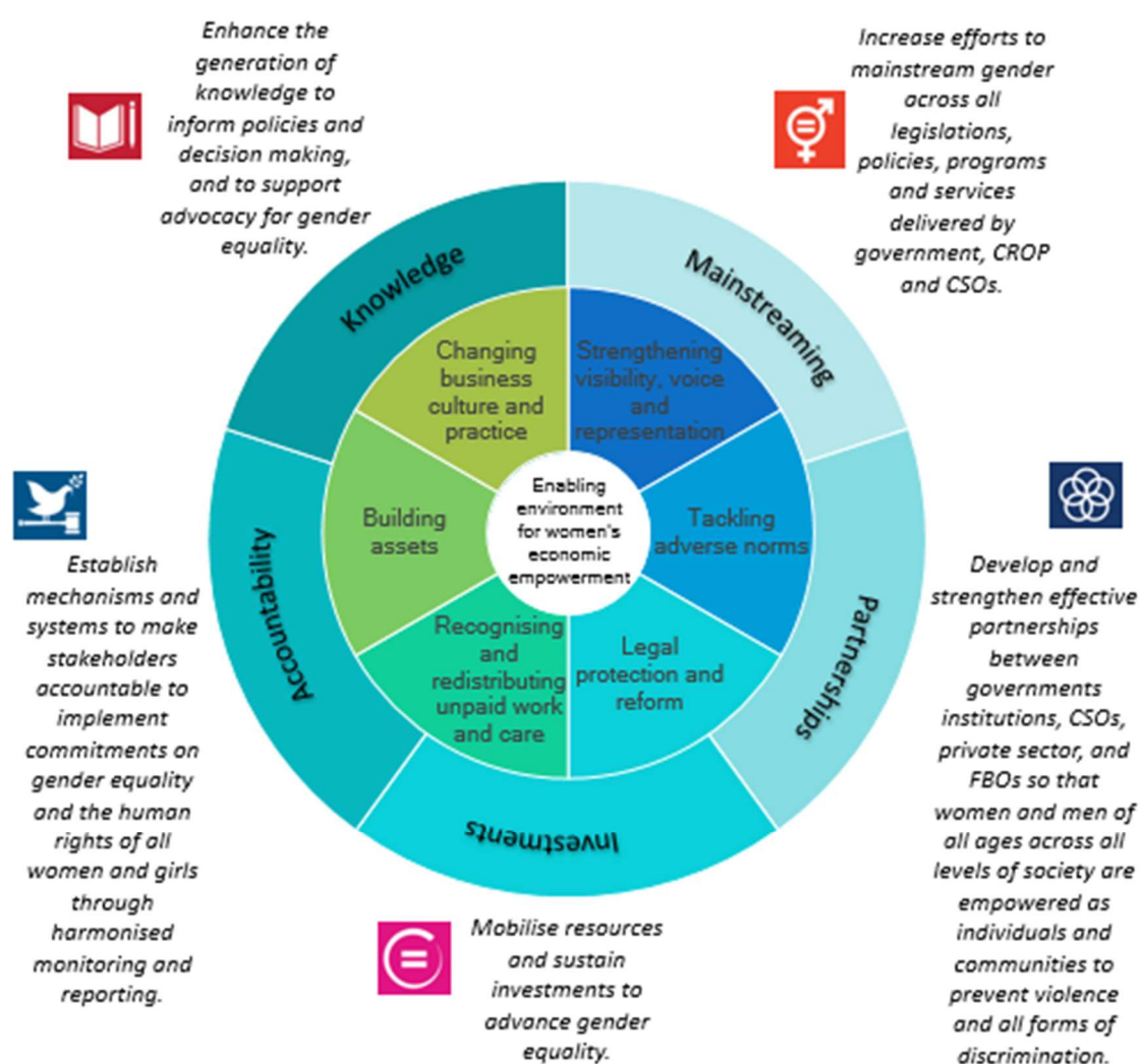
Figure 3: The relationship between the PPA strategies and the UNHLP-WEE's 7 primary drivers for women's economic empowerment

70. The measures proposed by the PPA are in line and complement the 7 drivers identified by the UNHLP-WEE. While the 7 drivers provide the information on "what" need to change, the PPA provide "tools" on "how", or "what to do" to make it happen.