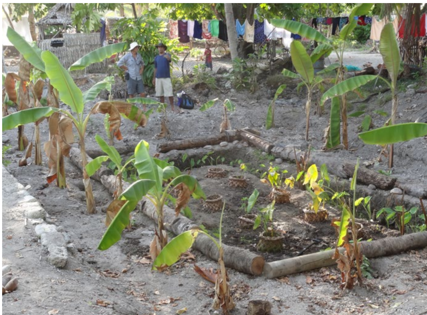
Babai food garden under development on Abemama Island, Kiribati in February 2017

How better to grow these crops than with traditional Giant swamp taro pits? ( Cyrtosperma merkusii , called babai in Kiribati and pulaka in Tuvalu). These have been historically dug by hand down to the water table. Many of these pits are now neglected but they provide a strong connection to both culture and underground water.