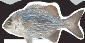
KERTAKA/KERILEL Rudderfish Kyphosus cinerascens Legal size: 10 inches