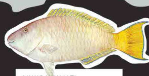
MWOMW, MEI Pacific longnose parrotfish Hipposcarus longiceps Legal size: 10 inches