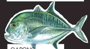
OARONG Giant trevally Caranx ignobilis Legal size: 14 inches