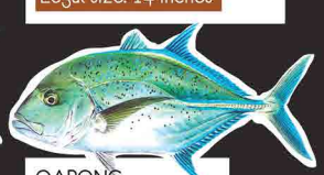
OARONG Bluefin trevally Caranx melampygus Legal size: 14 inches