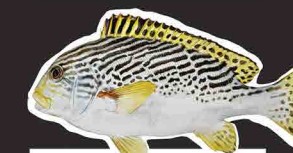
KOAHNG Diagonal banded sweetlips Plectorhinchus lineatus Legal size: 14 inches