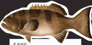
SAWI Black-saddled coral grouper Plectropomus laevis Legal size: 14 inches