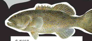
SAWI Squaretail coral grouper Plectropomus areolatus Legal size: 14 inches