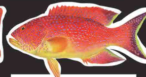
SAWI PWILIET Yellow-edged lyretail Variola louti Legal size: 14 inches