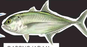
OARONG/ADAM Bigeye trevally Caranx sexfasciatus Legal size: 14 inches