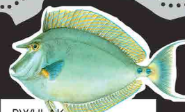
PWULAK Bluespine unicornfish Naso unicornis Legal size: 14 inches