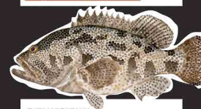
RIPWIRIPW Brown-marbled grouper Epinephelus fuscoguttatus Legal size: 24 inches