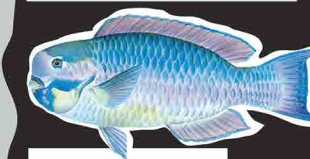
MAHU Steephead parrotfish Chlorurus microrhinos Legal size: 14 inches