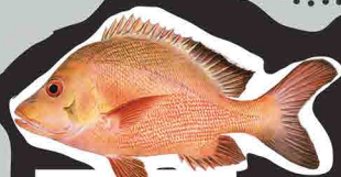
PWAHLAHL Humpback snapper Lutjanus gibbus Legal size: 10 inches