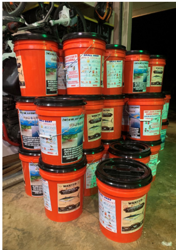
Orange bucket initiative for fishers to keep important things dry such as a cell phones, safety equipment, and food and water.

In addition to safety equipment, over 100 orange watertight buckets with lids for holding sea safety equipment and keeping personal items dry were also distributed, along with boat name stickers to help identify boats.