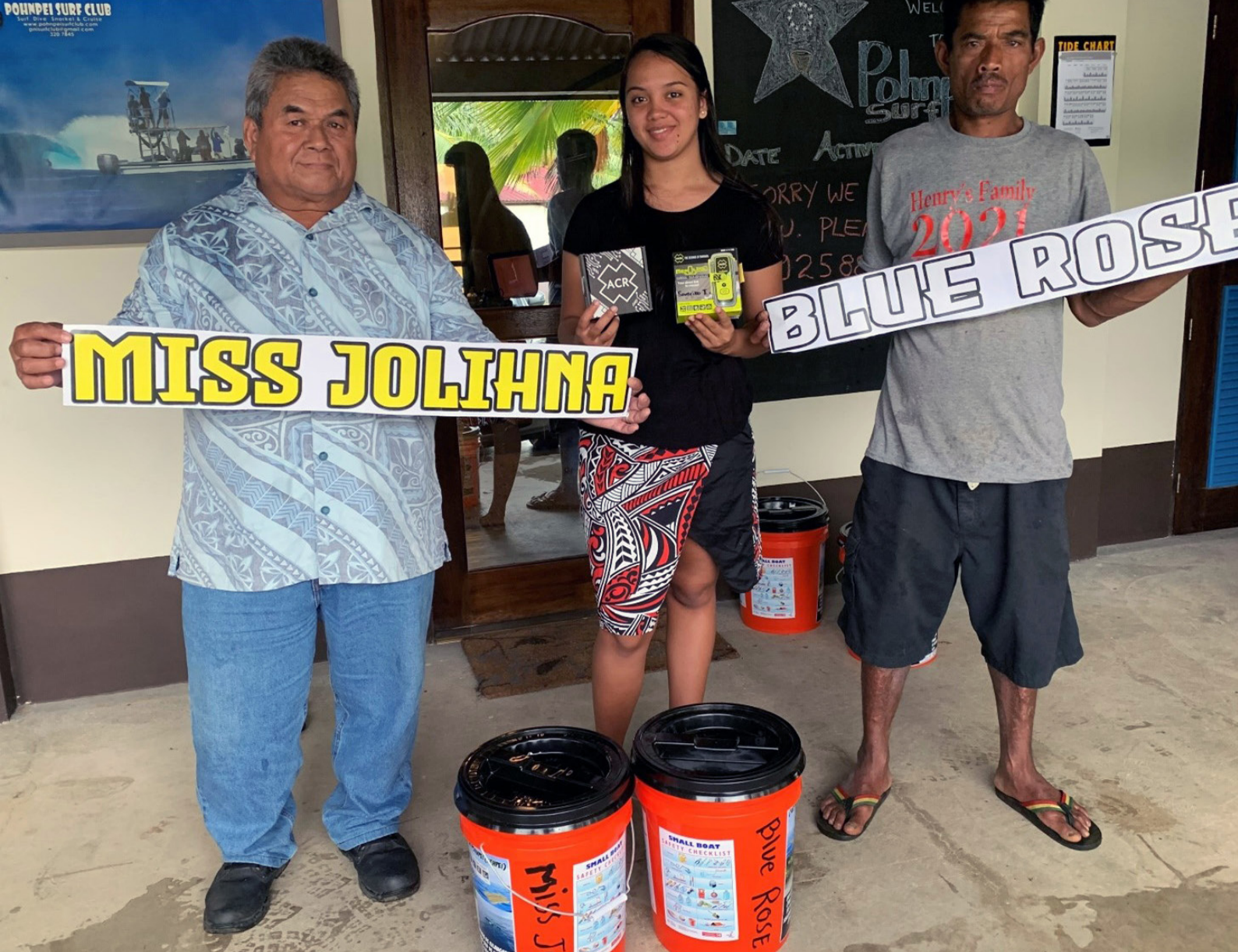
Assisting fishers with boat registration – Fishers receive a sticker of their boat's name.