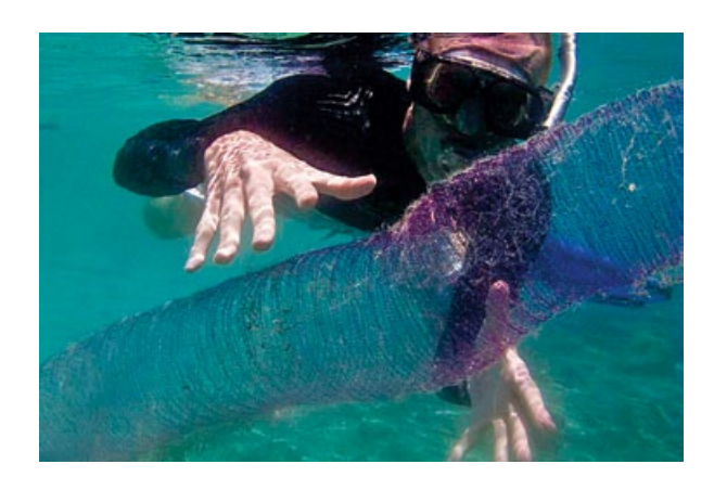
Figure 5. A diamondback squid egg mass at Madang in Papua New Guinea (source: https://morealtitude.wordpress. com/2008/10/13/, downloaded on Thursday 17 July 2014).