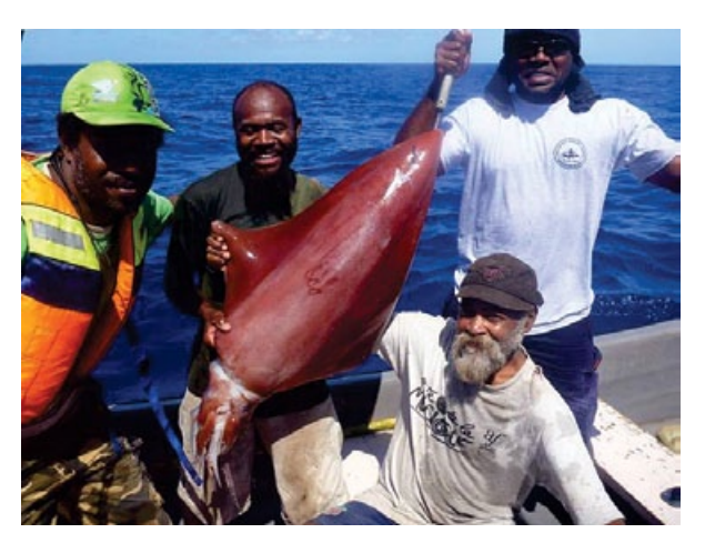
Figure 2. First diamondback squid catch at Aneityum Island, Vanuatu.