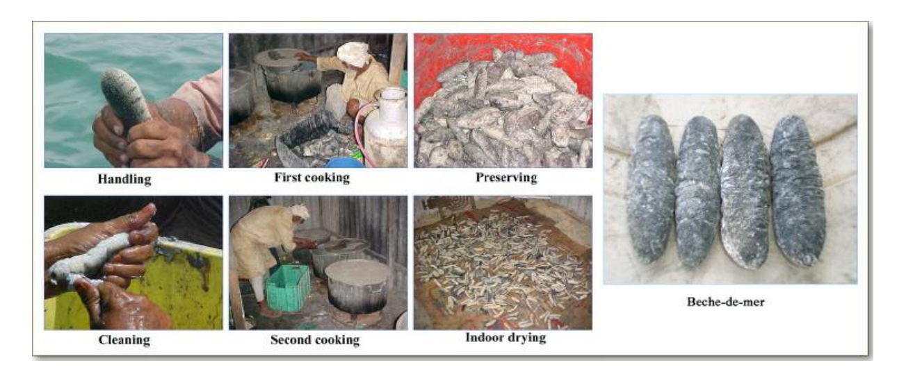
Figure 3. Steps for processing H. scabra in Oman, Mahout area.

November. The primary reason for low landings of shrimp in November is the migration of shrimp at this time to deeper waters for spawning. And because fishermen use only traditional cast nets to catch the shrimp, once the shrimp go to deeper waters the fishermen are no longer able to catch them. Therefore, in November, fishers begin collecting sea cucumbers. When the shrimp fishing season ends, sandfish harvesting begins. Sea cucumber harvesting begins in late November, reaching its peak between January and March, and then gradually decreasing through to May. The shrimp fishing season is related to the socioeconomic traditions of the Mahout communities as well as sea conditions. Because most Mahout communities are Bedouins, they seasonally move out of Mahout to adjacent areas, particularly during the summer months (June–August) when sea conditions are too rough for fishing due to the southwest monsoon.