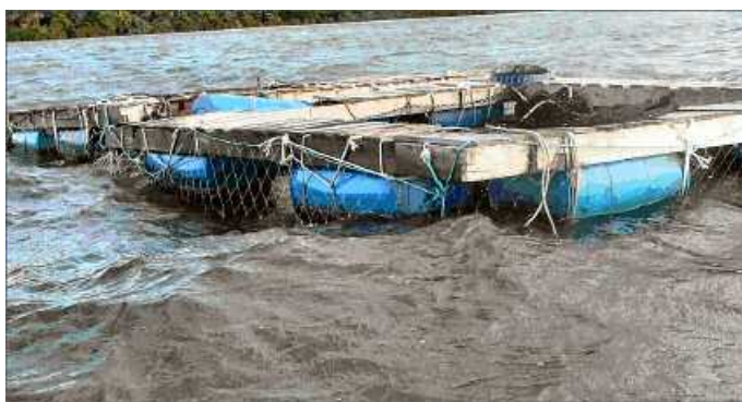
Figure 3. Live reef food fish cages on the island of Tavea (photo by Ledua Ovasisi).