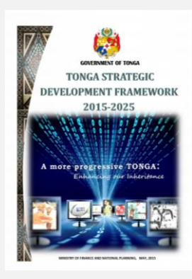
The Tonga Strategic Development Framework 2015 – 2025 includes Outcome F: a more inclusive, sustainable and effective land and environment management, with resilience to climate change and risk.